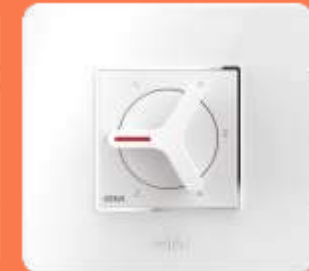
Regulator with X2 Plate