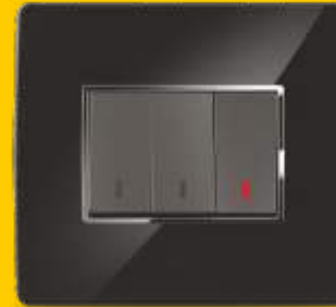
X-NOA with Genia Switches