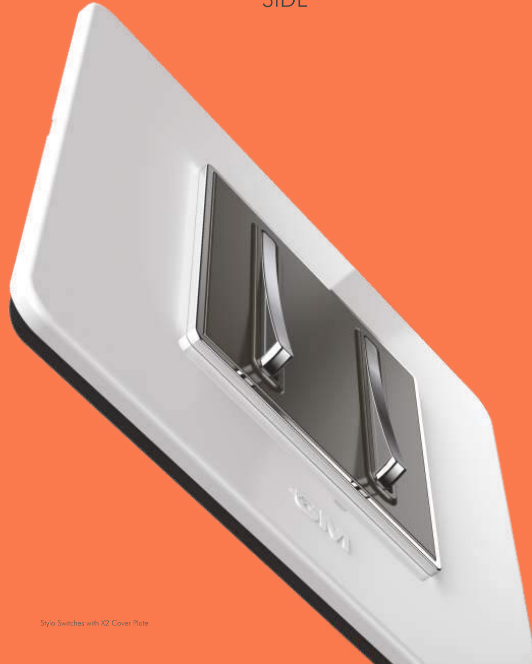
Stylo Switches with X2 Cover Plate