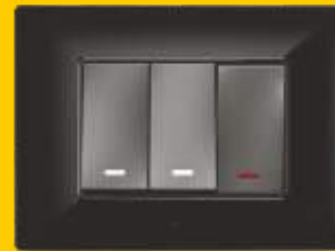
X-PULSE with Java Switches