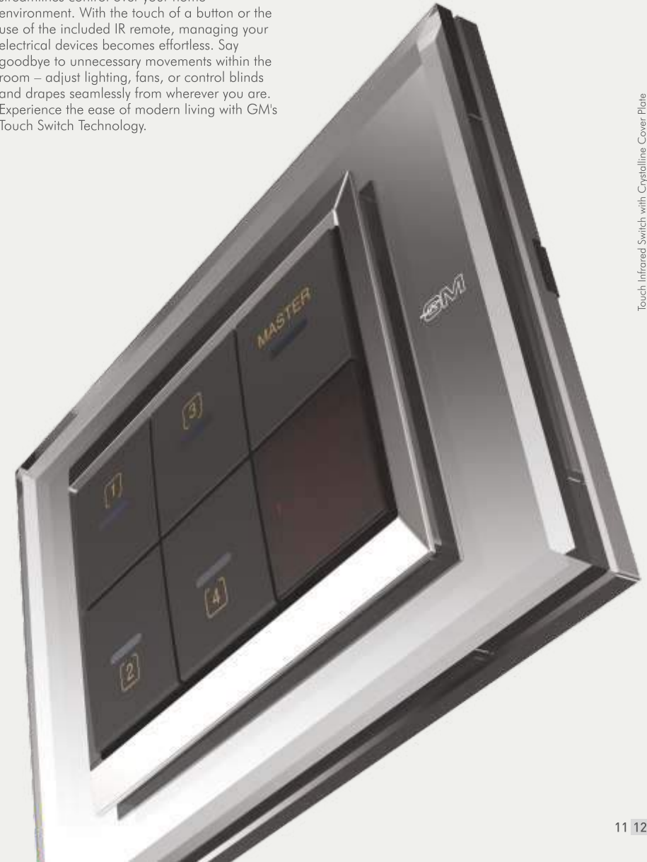
Touch Infrared Switch with Crystalline Cover Plate

In a world where comfort simplifies life, even the smallest advancements can elevate our quality of living. Our Touch range of switches, brings you a user-friendly technology that streamlines control over your home environment. With the touch of a button or the use of the included IR remote, managing your electrical devices becomes effortless. Say goodbye to unnecessary movements within the room – adjust lighting, fans, or control blinds and drapes seamlessly from wherever you are. Experience the ease of modern living with GM's Touch Switch Technology.