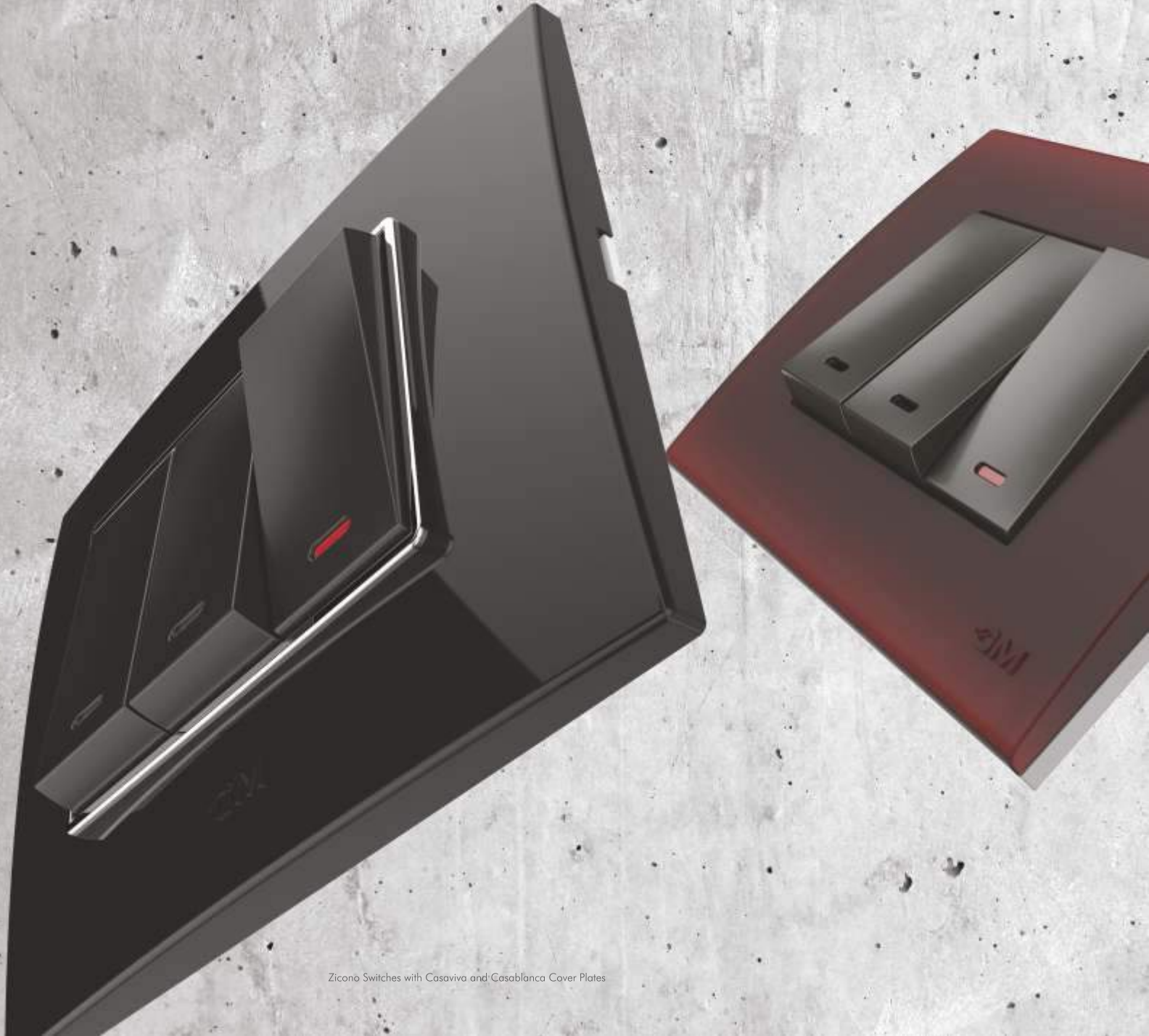
Zicono Switches with Casaviva and Casablanca Cover Plates