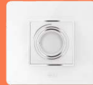
Dimmer with X2 Plate