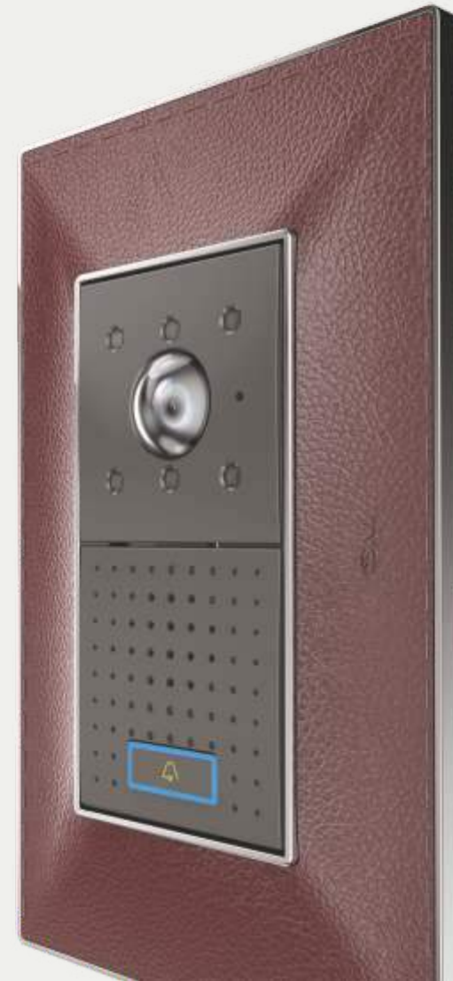
i-Cam Video Door Phone with Wavio Leather Cover Plate