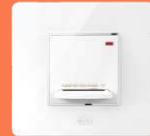
Key Tag with X2 Plate