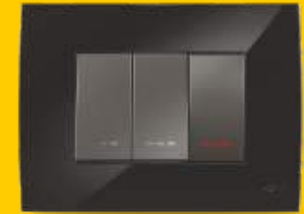
X-PLANA with Viva Switches