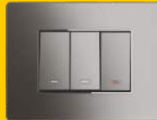
X-STELA with Nexa Switches