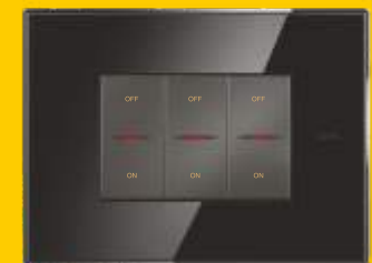
X-BRILLO with Touch Switches